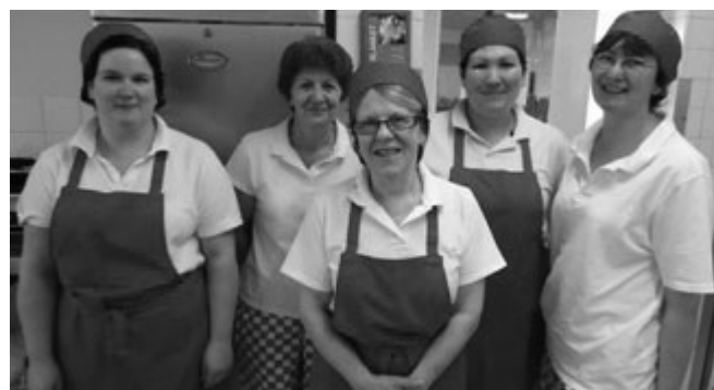
High School catering team met the challenge of feeding hungry delegates