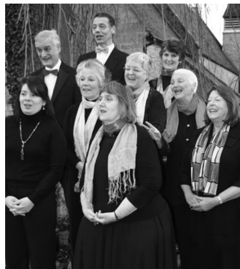
Cantamus chamber choir in action

Cantamus' next concert is the popular annual afternoon event, now in its third year. On Sunday 3rd. March the choir will perform a concert for Mad March Hares at the Townsend Hall, with music, readings, and opportunities for the audience to sing, accompanied by tea and home-made cakes. For full details see the ad on page eight.