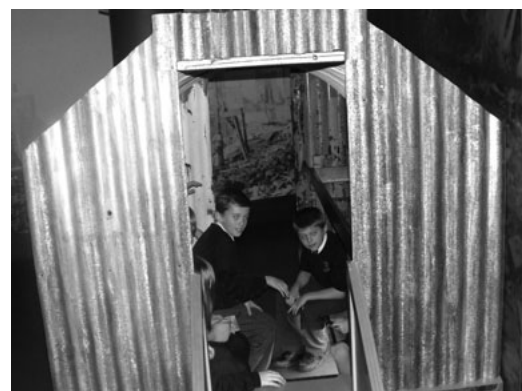
Pupils try out a shelter at the Imperial War Museum