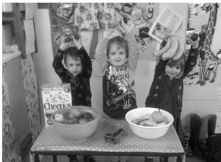
The children get ready for some advice on healthy eating