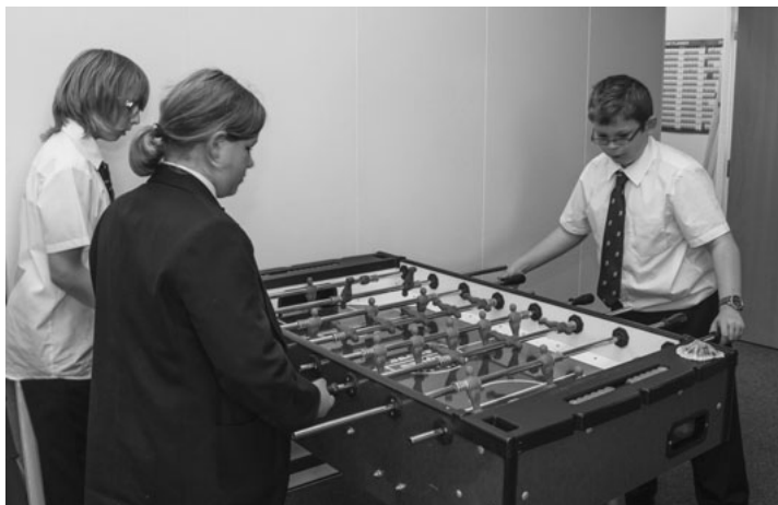
Table football - one of many activities available at the Youth Club